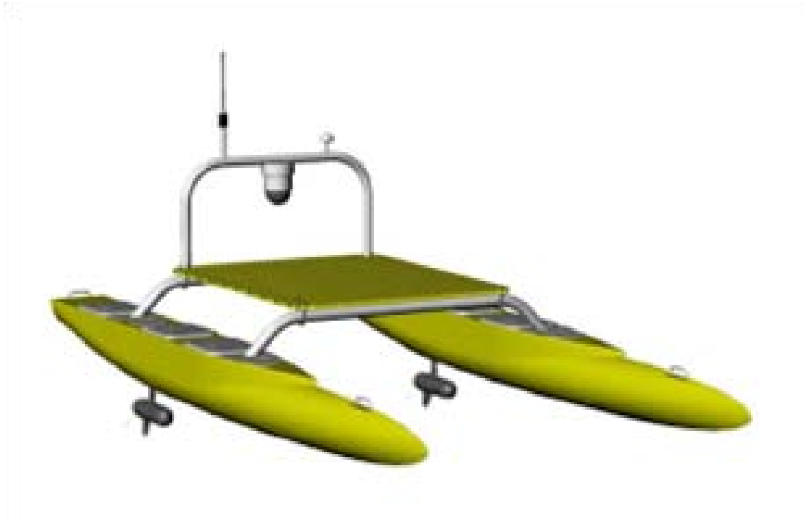
Figure 2: NURC's Autonomous Surface Vehicle (ASV)